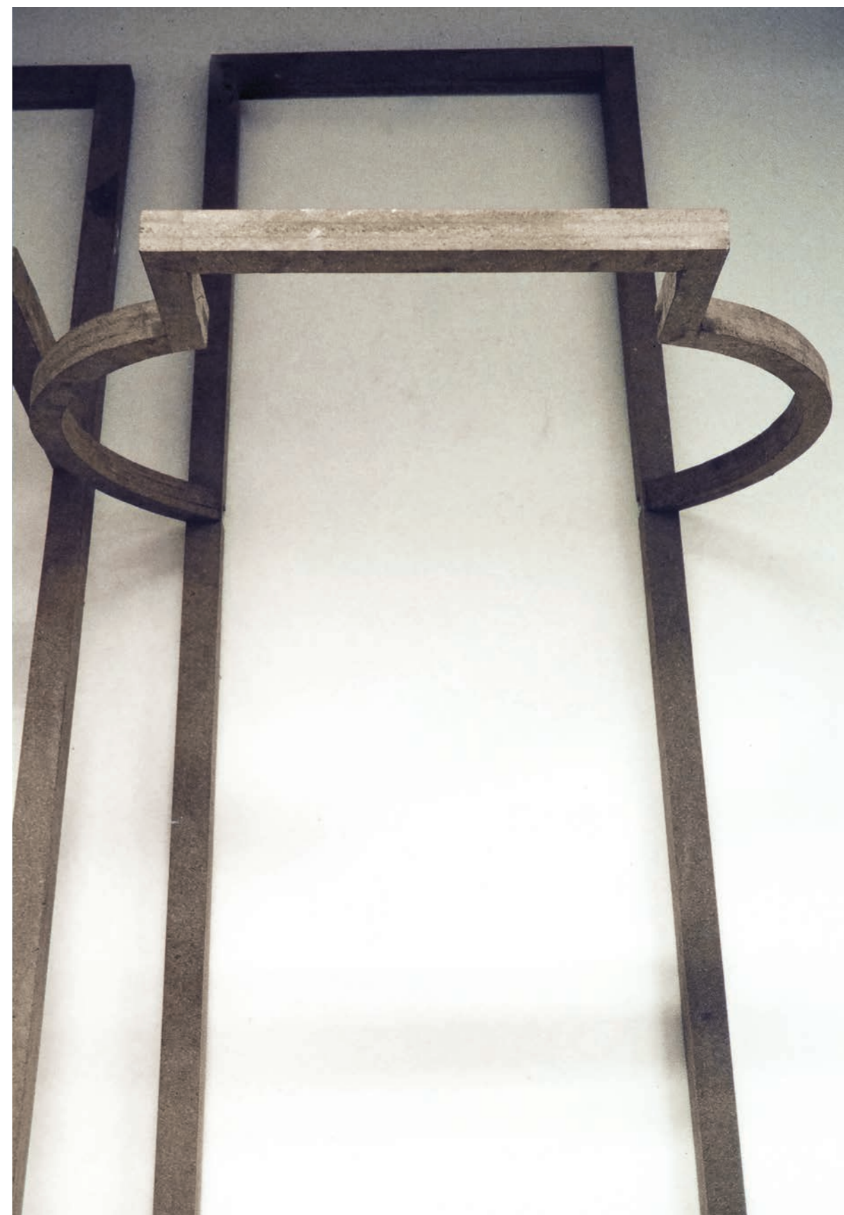
Les balcons , 1996. Bois aggloméré et contre-collé. 2 éléments de 125 × 410 × 75 cm. The balconies , 1996. Clipboard et laminated wood. 2 pieces: 125 × 410 × 75 cm.