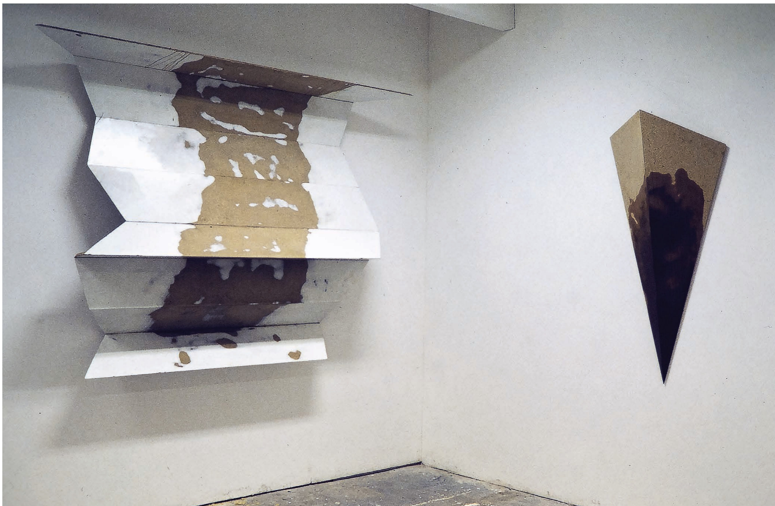
Les appliques , 1996. Bois aggloméré et plaquage. 2 éléments : 140 × 160 × 30 cm et 60 × 150 × 25 cm. The fixtures , 1996. Chipboard and plating. 2 pieces : 140 × 160 × 30 cm and 60 × 150 × 25 cm.