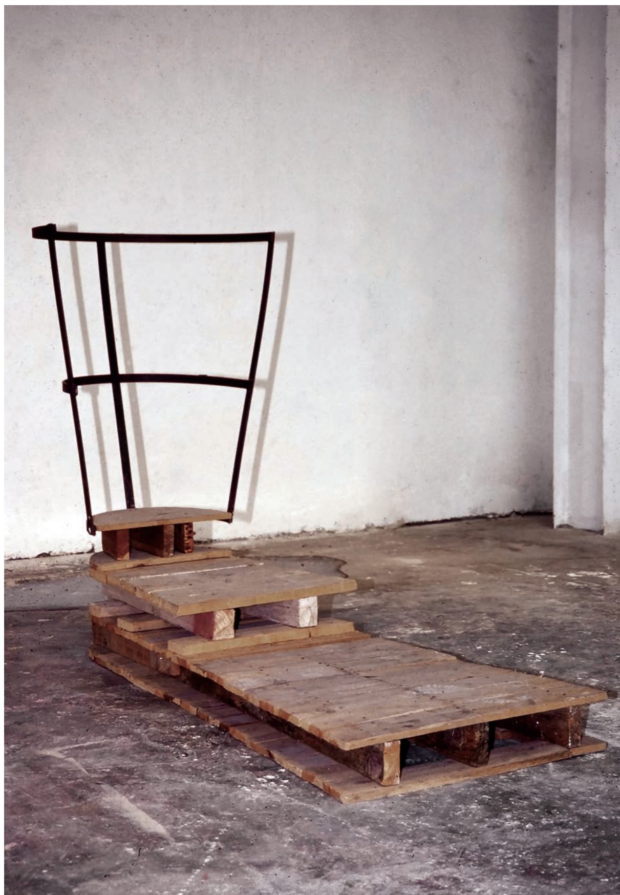
La proue , 1996. Bois de palette et acier. 180 x 150 x 80 cm. The bow , 1996. Pallet wood and steel. 180 x 150 x 80 cm.