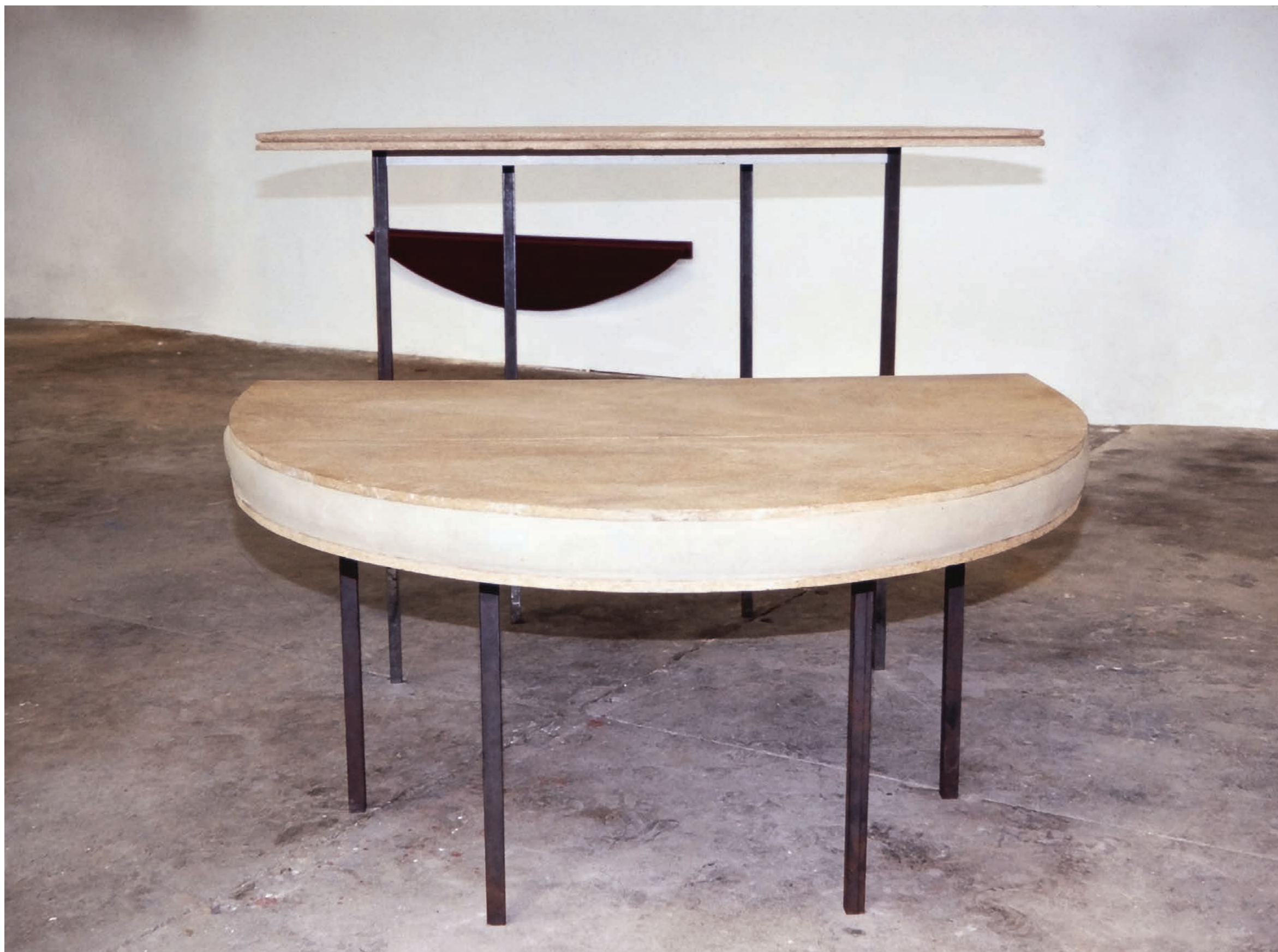
Les rallonges , 1996. Bois aggloméré, mousse, acier, chromes. 550 x 260 x 300 cm. The extension wings , 1996. Chipboard, foam, steel, chrome. 550 x 260 x 300 cm.