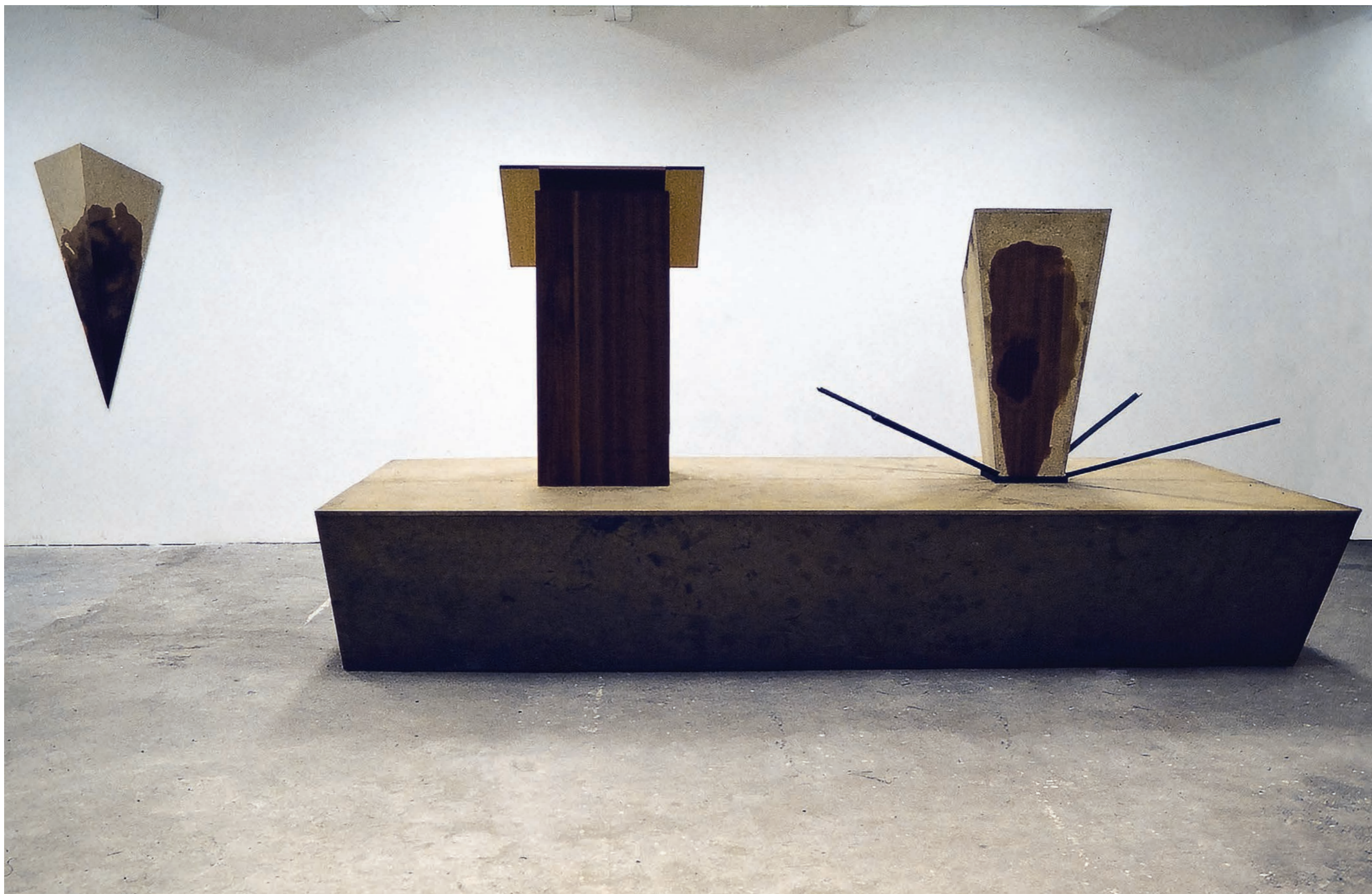
Les tribunes , 1996. Bois aggloméré, contreplaqué, plaquage, acier. 400 x 125 x 190 cm. The rostrums , 1996. Chipboard, plywood, plating, steel. 400 x 125 x 190 cm.