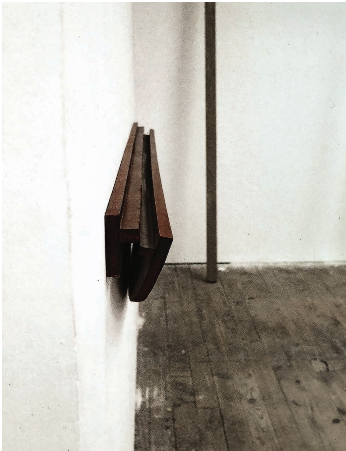
Les œuvres vives , 1996. Bois, peinture antifouling, charnières. 220 x 65 x 20 cm. The under works , 1996. Wood, anti-fouling paint, hinges. 220 x 65 x 20 cm.