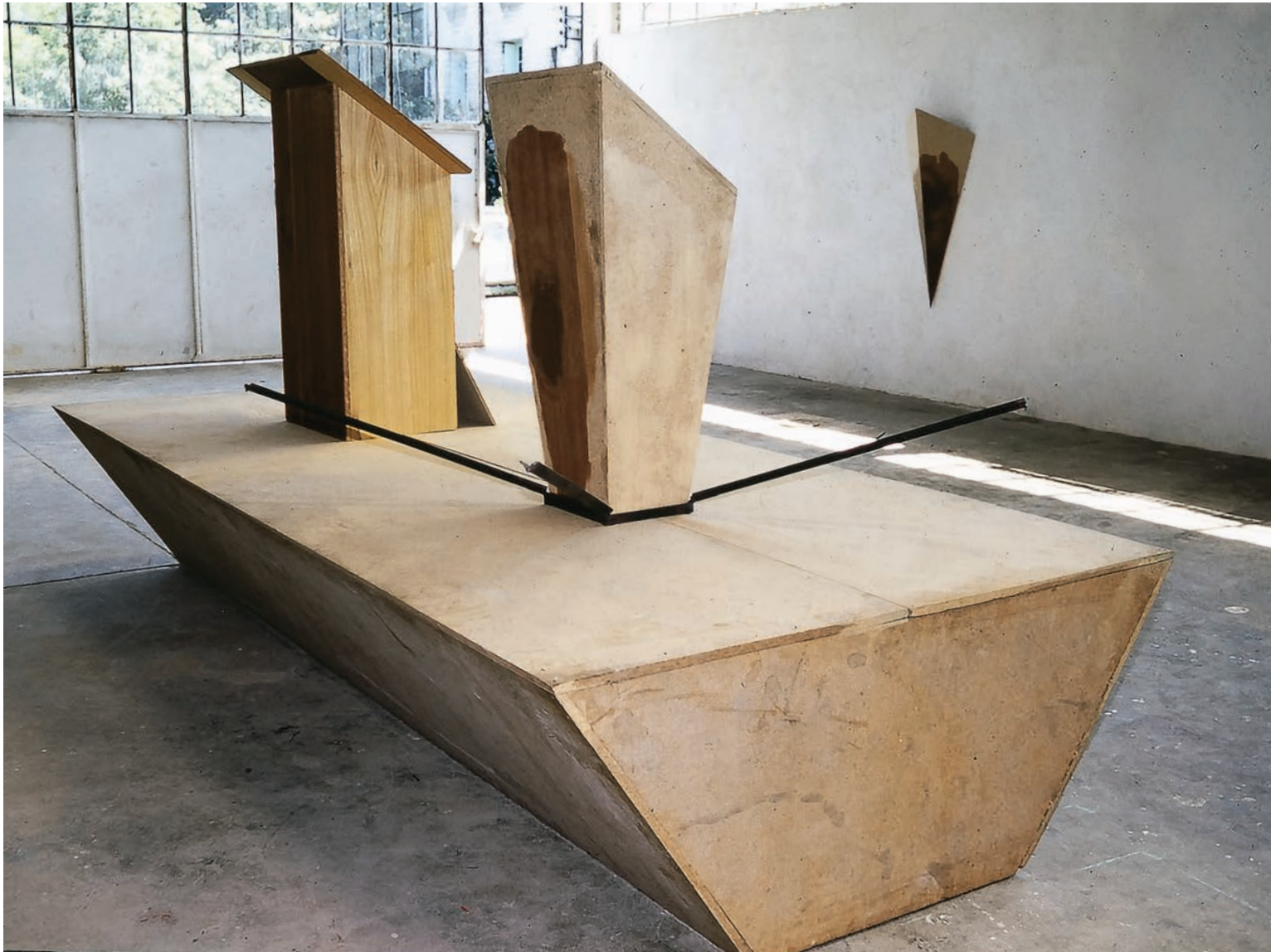
École Supérieure des Beaux-Arts de Montpellier.